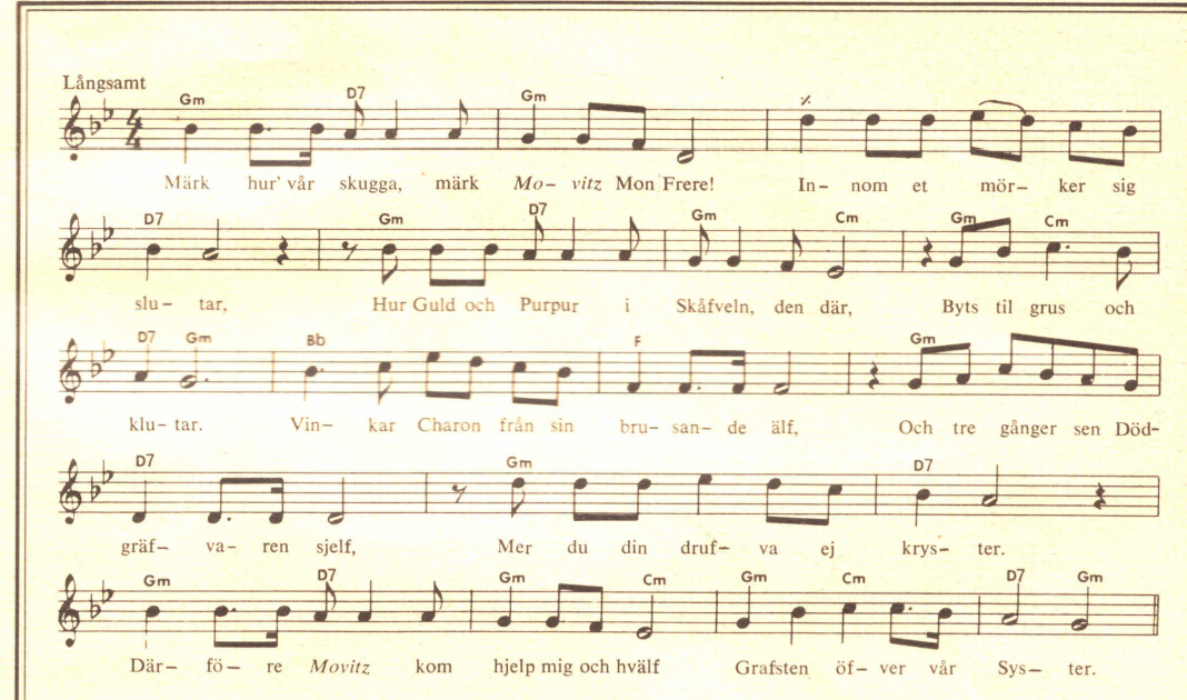
Copyright © 1971: Intersong-Förlagen AB, Stockholm

Ach längtansvärda och bortskymda skjul, Under de susande grenar, Där Tid och Döden en skönhet och ful Til et stoft förenar! Til dig aldrig Afund sökt någon stig, Lyckan, eljest uti flygten så vig, Aldrig kring Grifterna ilar. Ovän där väpnad, hvad synes väl dig? Bryter fromt sina pilar.